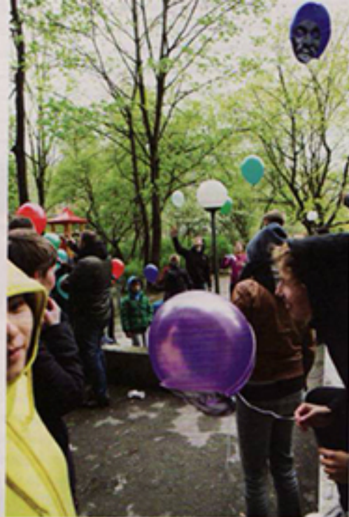
Invisible Playground, Open Playground, April 27 2013, Berlin